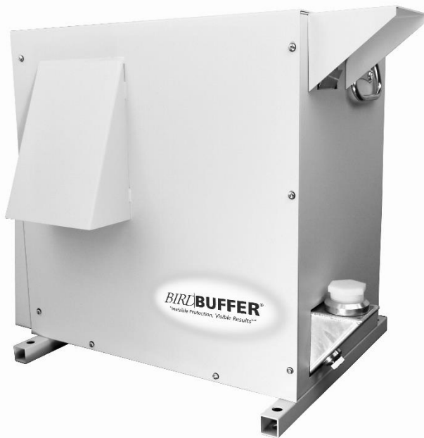
BirdBuffer® Q4 Model