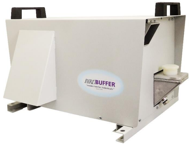
BirdBuffer® TD II Model